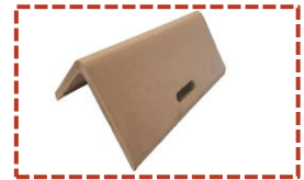
• Heavy-Duty (*)