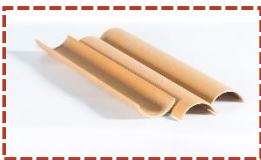
• C Profile