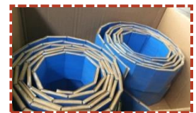
• Roll Protector